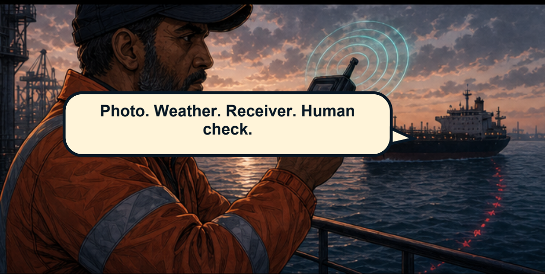
Photo. Weather. Receiver. Human check.